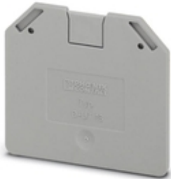
End cover, length: 52.8 mm, width: 2.2 mm, height: 47.3 mm, color: gray

Please be informed that the data shown in this PDF Document is generated from our Online Catalog. Please find the complete data in the user's documentation. Our General Terms of Use for Downloads are valid ( http://phoenixcontact.com/download )